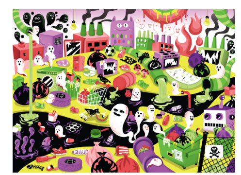
Winie Widya Ariany | Indonesia