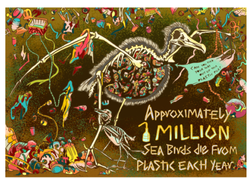
yell0w | Singapore