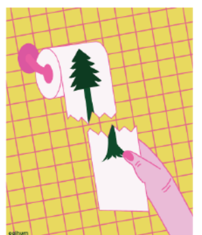
eelhum | Singapore